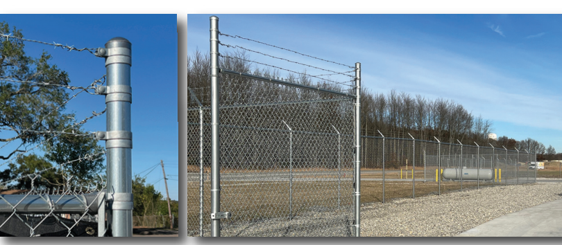
PT 15 vs. Structural Galvanized